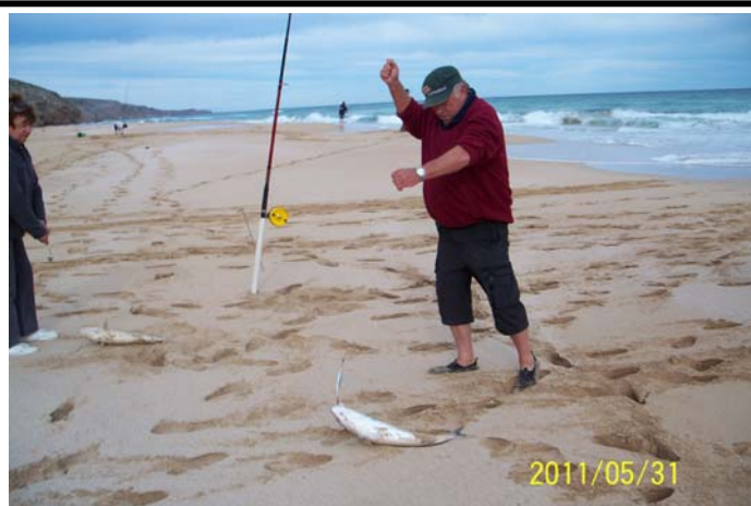
The winning photo for the Inaugural Fishing Photographic competition held for the duration of the Salmon Fishing Championship 2011.

Remember —if there is a specific book you wish to borrow, we are able to access all libraries in the State through the Lock Community Library.