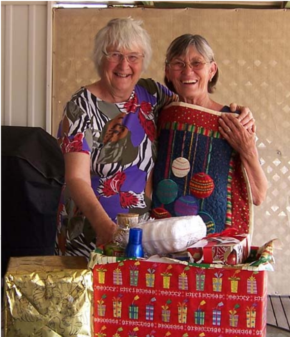
Elliston CWA Raffle